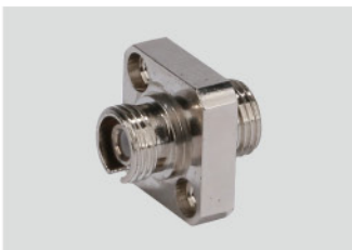
Ceramic sleeve embedded in metal shell