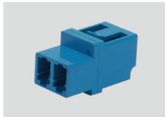
Ceramic sleeve embedded in plastic casing