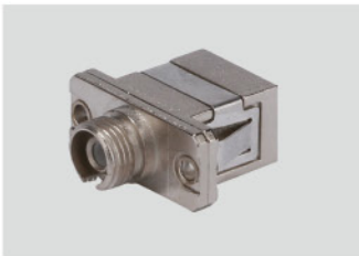
Ceramic sleeve embedded in metal shell