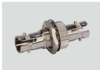
Ceramic sleeve embedded in metal shell