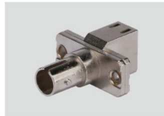
Ceramic sleeve embedded in plastic and metal shell